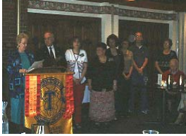
Installation of Officers 2004-05

“It’s Not How Much We Give, But How Much Love We Put Into Giving.”