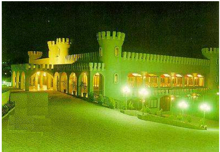
One of the biggest Italian restaurants in the city