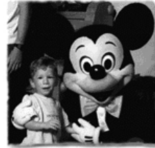
my son & Mickey Mouse