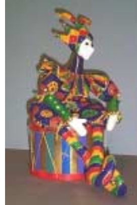
Betsy's "Round To It Doll"

The February Meeting will be held February 21st at 10:00 am ( note: not the 15th as was on the schedule ) at the Library in Central. The program for the meeting will be a show and tell of our monochromatic dolls. We drew our color at the January meeting. If you were not there and want to make a doll, choose a single color and make a doll using different values of that color and bring it to the meeting. We are also hoping that there will be some finished Negative design dolls from the members who attended the Seminar. Work hard and bring them to the meeting.