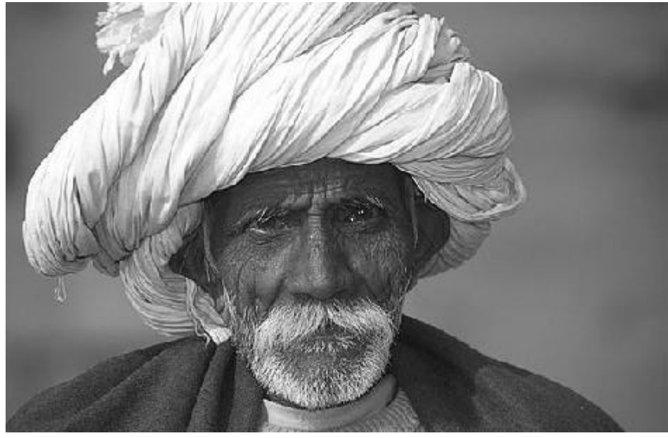
Could this chap be the future Headmaster? Time will tell...

Outsourcing of this nature is common amongst corporations for whom increasing profits at any cost is the highest priority. At St. Chris, the move will also be justified as part of the Rajasthan project, at least according to one source. Apparently, the skills of the workforce in that region have