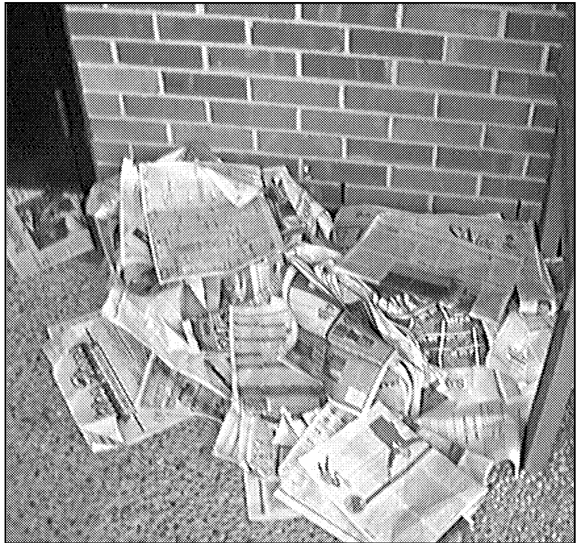
All the news that's fit to leave lying around in a big ugly stupid mess.

"I just don't understand why they can't deliver our meals to us," one student said. "I mean really, why am I paying to be here?"