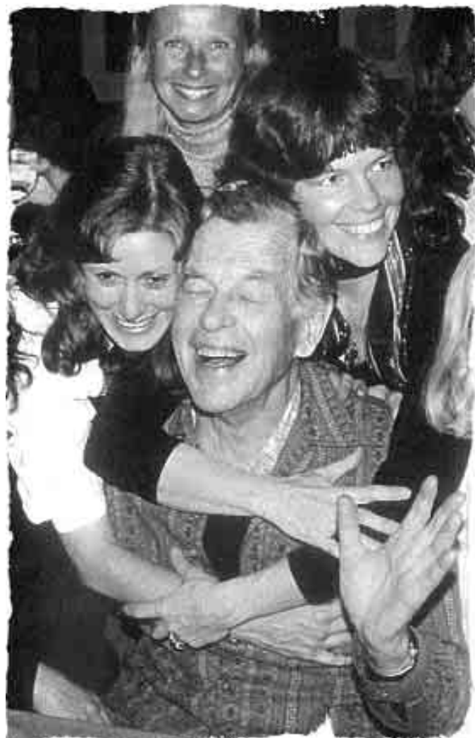
Joseph Campbell at Esalen, 80th Birthday, 1984