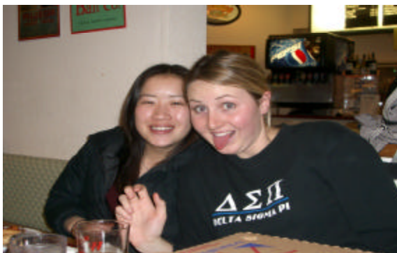
Professionalism at it's finest.

time. Many pledges went to make deliveries to friends and floor mates to earn that extra bit of money. When they finally had the chance to, this first fundraiser became the official one for the pledge term. Lampost became a place where the Upsilon's could always fall back on for some extra money to put into the account. Thanks Lampost!