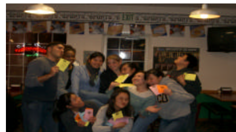
What's everyone looking at?

Toward the end of the pledge term, the pledge class and I started to collaborate a lot more on finance events because of unexpected twists along the road, and the experience has been extremely rewarding. Like I've been trying to say, this position and pledge term has been one of the most memorable experiences of my life, and I'm glad I could have contributed to the Upsilon's in all the ways I have.