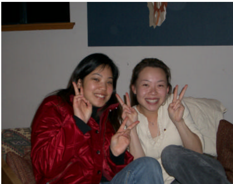
Two plus two is eight, no wait...