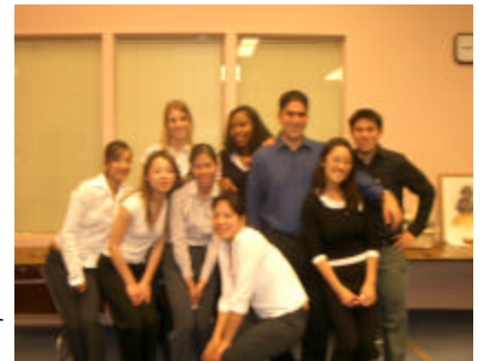
Upsilon s after a night of our humanitarian accomplishment.