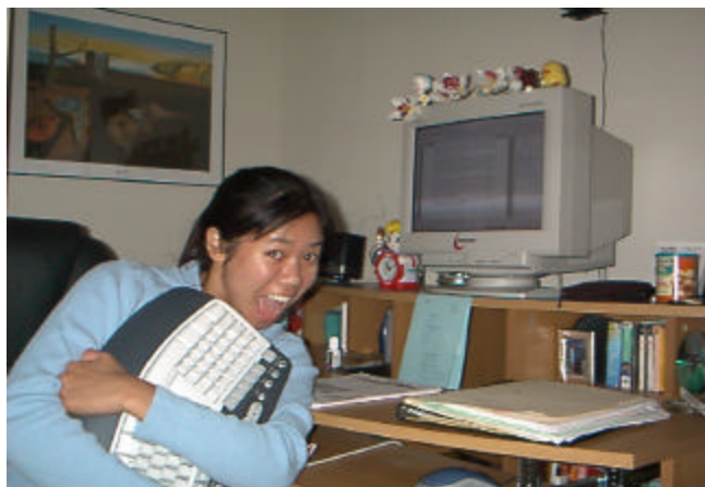
Meet Superman (my computer), aka my new best friend.