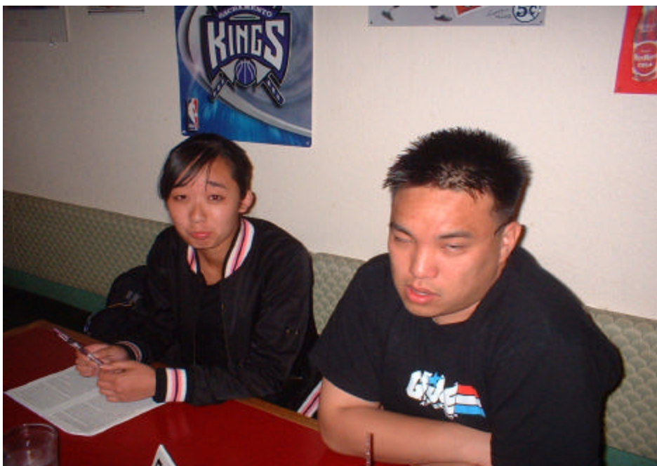
A picture is indeed worth a thousand words

Already there, I feel guilty and remorse. Deep down inside I know I can do better for myself, but I was not feeling the motivation or inspiration. Luckily, recruitment comes along and Delta Sigma Pi impresses me with their presentation with their first event, "Meet the Chapter." It all seems like yesterday when I was in my room anxiously waiting to see if I receive a bid, yet at the same time that also seems like eons ago. Through out the whole pledging process, I learned self-discipline in addition to time