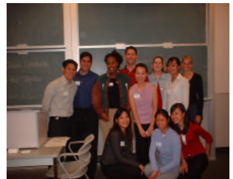
Future UC Davis, Graduate School of Management students!

Or Visit their website: www.gsm.ucdavis.edu