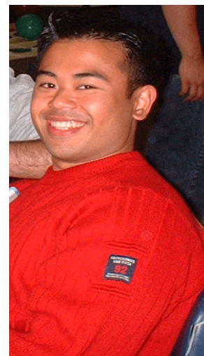
Our Pledge Dad! Isn't he Adorable?

Being the Vice President of Pledge Education, the Pledge Dad, the Big Pappa, is probably one of the best experiences ever, something that I would never trade. One is able to give back to the fraternity by shaping the future of its members to carry on the greatness and high standards that we uphold. It is also so rewarding to see individuals grow and to know that you had a little bit to do with it, while at the same time I myself gained greatly from this experience learning from each one of my kids. The pledging process is said to be the greatest and most fun times and it definitely is. Some parting words from your Pledge Dad: Upsilon's I am really proud of all of you. You all came in not really knowing one another and not knowing what to expect. 10 different people, with 10 different personalities, but you got through the pledging