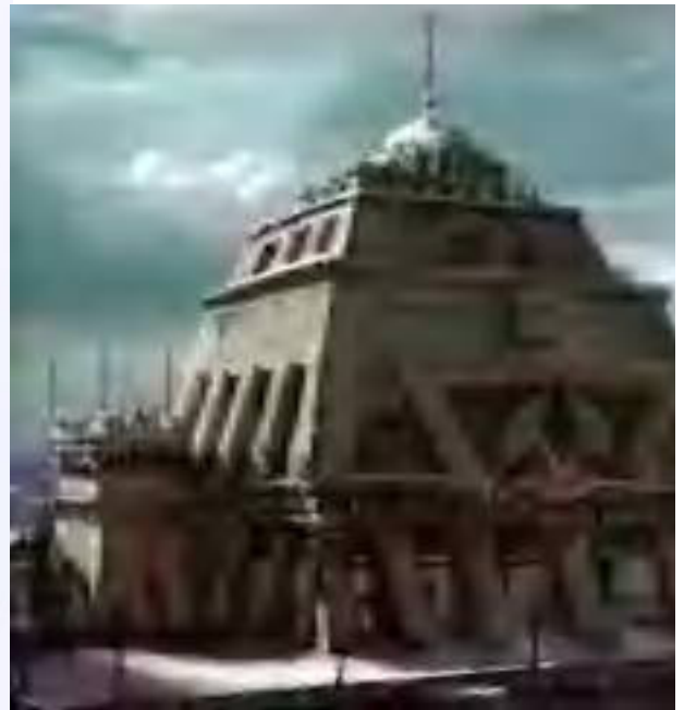
Above: The Great Hall, Qo'noS

It has been a very memorable spring for the crews of the USS Nelson and the IKV Astris. We were well represented at the Summit, and I had the good fortune of being able to attend the KAG Attacks! 20th anniversary celebration in Columbus, Ohio.