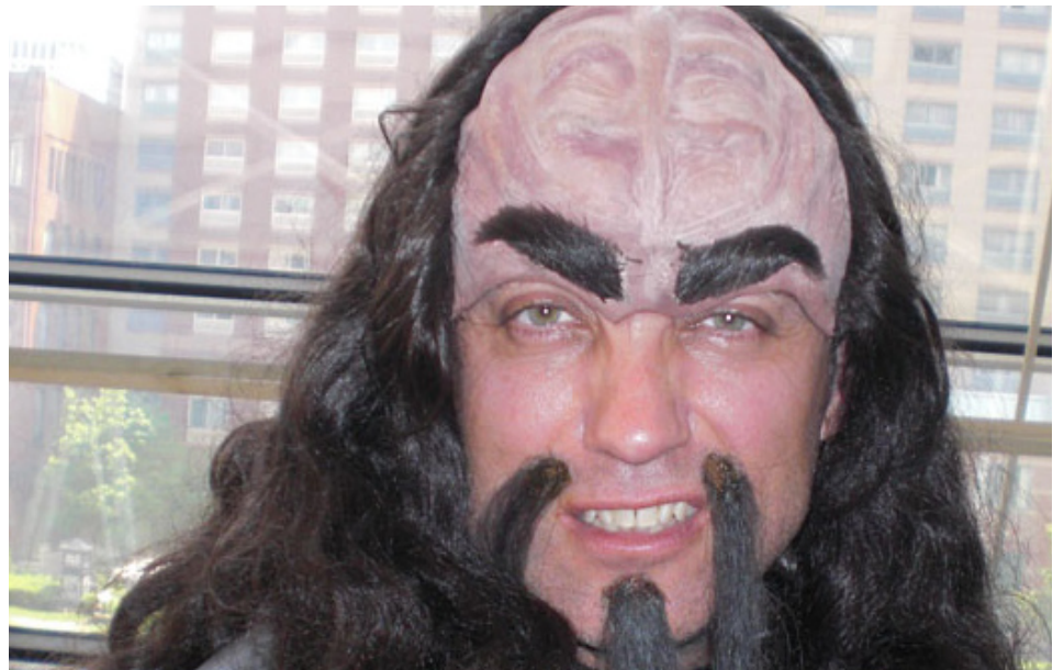
Above: Kalex, the Dark Moon Fleet Cmdr.

Left: A strange life form we encountered on our trip to Ohio: a 'Dalek'