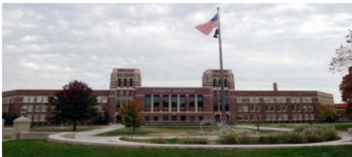
Wyandotte High School