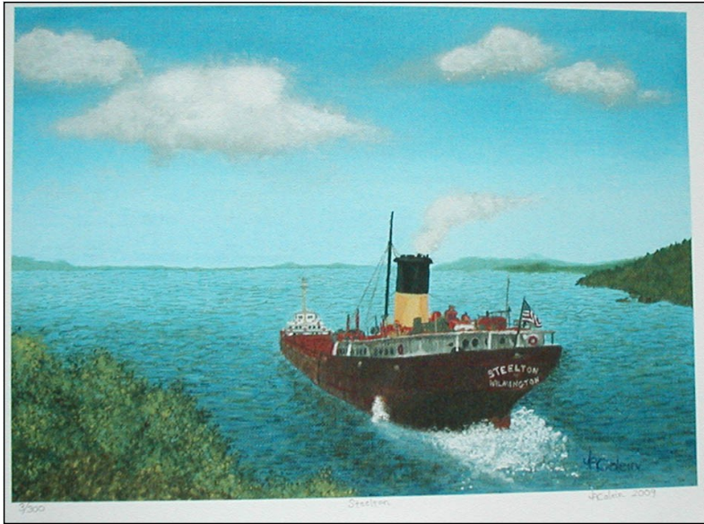
Steelton, print (3/100) on foam core by Judy Colein ←