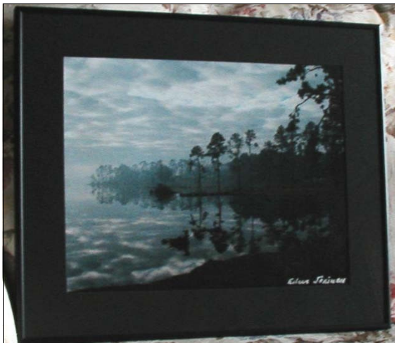
Framed photograph by Eileen Jokinen, almost eerie in its tranquility, perfectly set off by a black matt and frame