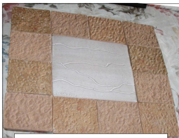
Stoneware tile landscape by Vick Vista