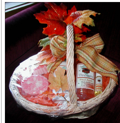
← Flowing curves distinguish a coiled fabric basket in vi- brant fall colors by Janet Bou- jon Couch